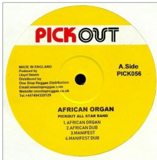
VINYL LP 17,99€