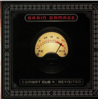
2 VINYL LPs 32,99€