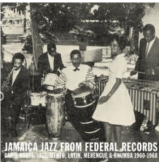
JAPAN IMPORT 2LP 44,99€