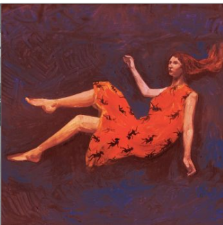
VINYL LP 24,99€