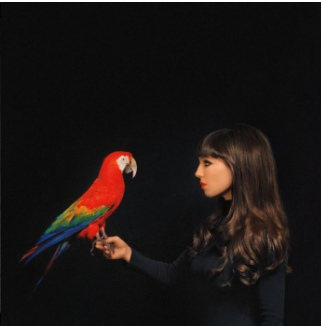
VINYL LP 29,99€