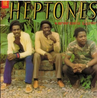
VINYL LP + 12" 36,99€