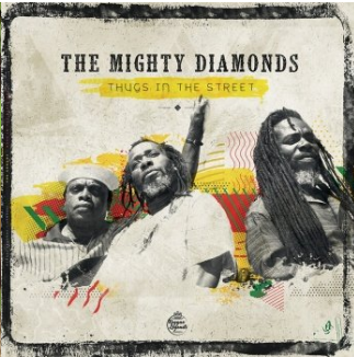
2 VINYL LPs 42,99€