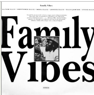
ORIG. PRESS LP 26,99€