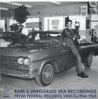
JAPAN IMPORT LP 35,99€