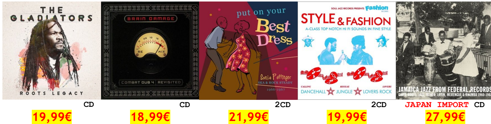
CD CD 2CD 2CD JAPAN IMPORT CD 19,99€ 18,99€ 21,99€ 19,99€ 27,99€