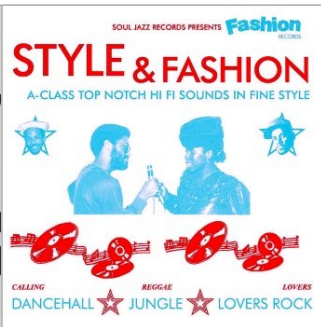
3 VINYL LPs 31,99€