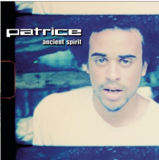
VINYL LP 29,99€