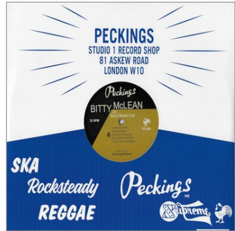
VINYL ONLY LP 27,99€