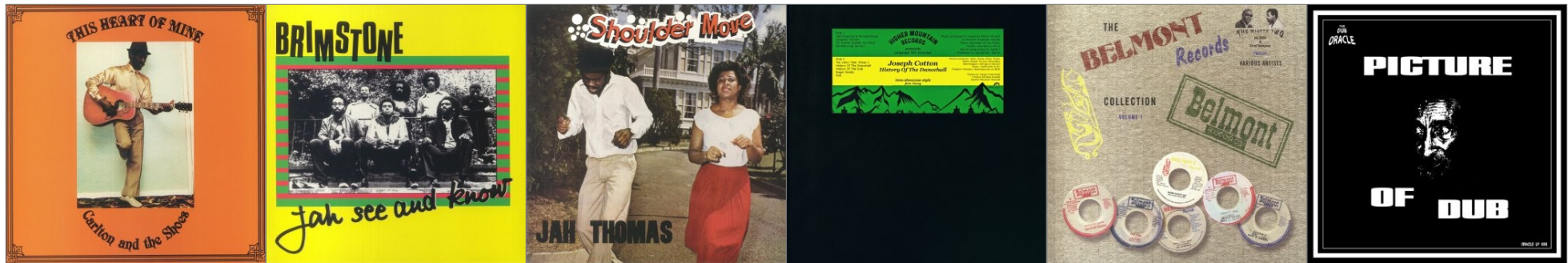
VINYL ONLY LP