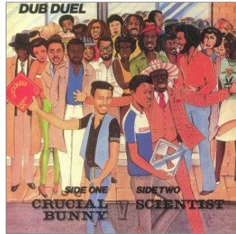
VINYL ONLY LP 31,99€