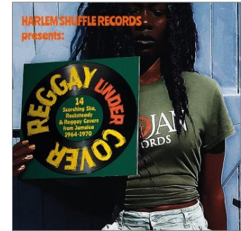
VINYL ONLY LP 29,99€