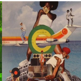
2 VINYL LP 29,99€