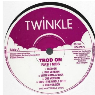
VINYL ONLY LP 18,99€