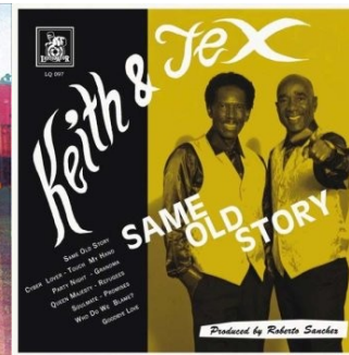
VINYL LP+CD 21,99€