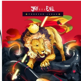
VINYL LP 25,99€