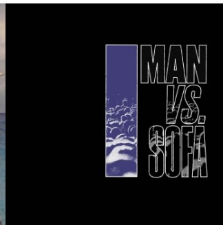
2 VINYL LP 27,99€