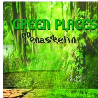
VINYL ONLY LP 19,99€

(GREEN COLOUR VINYL PRESS)..... GREEN PLACES (VOCAL & DUB).... ROOTS HITEK.... (GBR) (16/17). 19.99EUR