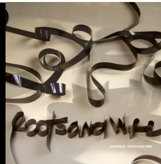
2 VINYL LP 35,99€