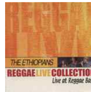
CD ETHIOPAINS LIVE AT REGGAE BASH