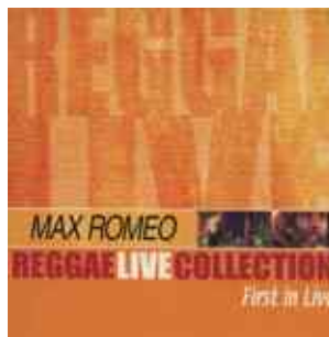
CD MAX ROMEO FIRST IN LIVE