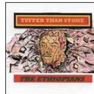
CD ETHIOPAINS TUFFER THAN STONE